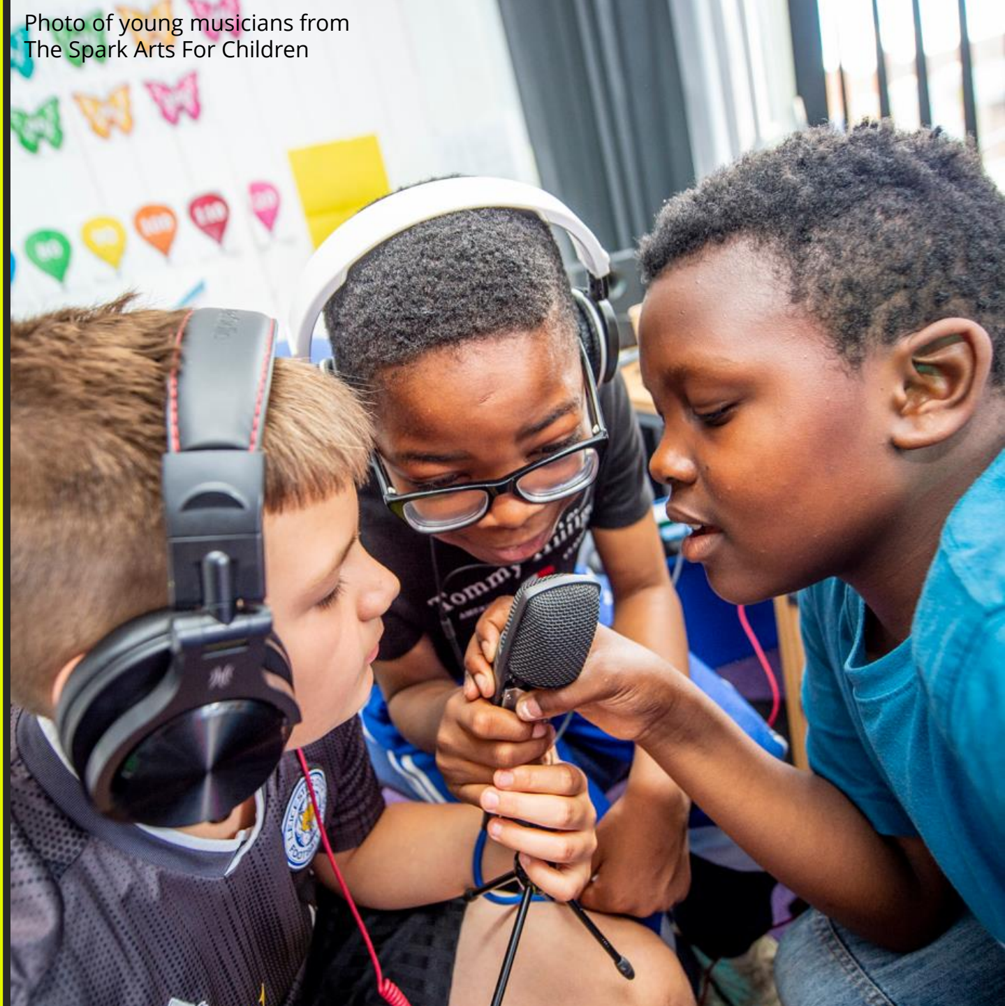
Photo of young musicians from The Spark Arts For Children